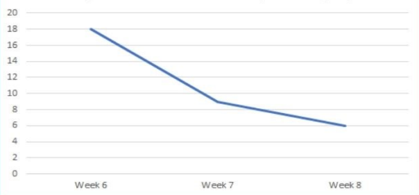
Negative Incidents Recorded (3 week cycle)

Our PBL lessons are based on data collected. The number of incidents has decreased due to the implementation of these lessons as indicated in the chart below.