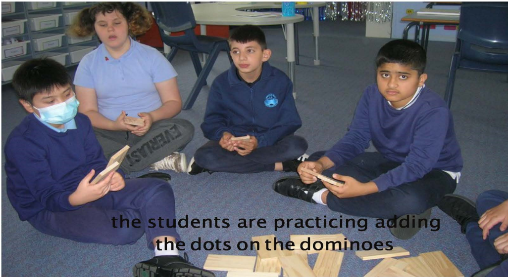
the students are practicing adding the dots on the dominoes

Wow term 4 is nearly over and where has the time gone! I would like to thank the parents for all their help over the remote learning. You have been amazing. We have come back to a term of excitement and fun. We are learning a lot of new concepts and have had time to learn about volume and capacity. We are further engaging with narratives and the Three Little Pigs story and its concepts of problems and solutions. The students are enjoying the writing and are showing good writing skills.